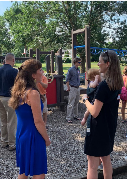
LEFT: New school families were paired with a host family at "Popsicles in the Park" on July 14.