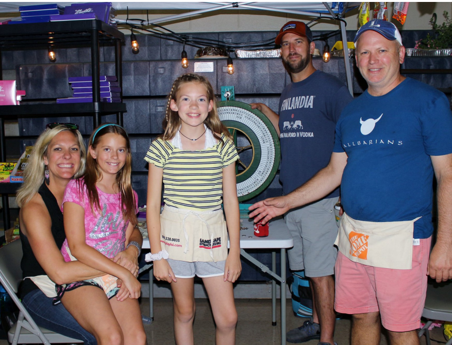
TOP LEFT: The 2019 Festival Homecoming was moved indoors June 7-8 due to wet weather, but was still a great time with food, games & community.